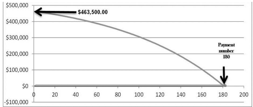
Graph 1. Amortization of debt

In the graphic we may observe from start to end, the behavior of the debt i.e. since mortgage loan is contracted whose amount is $ 463,500.00 with equal payments of $5,488.45, until the month number 180 (in year fifteen).